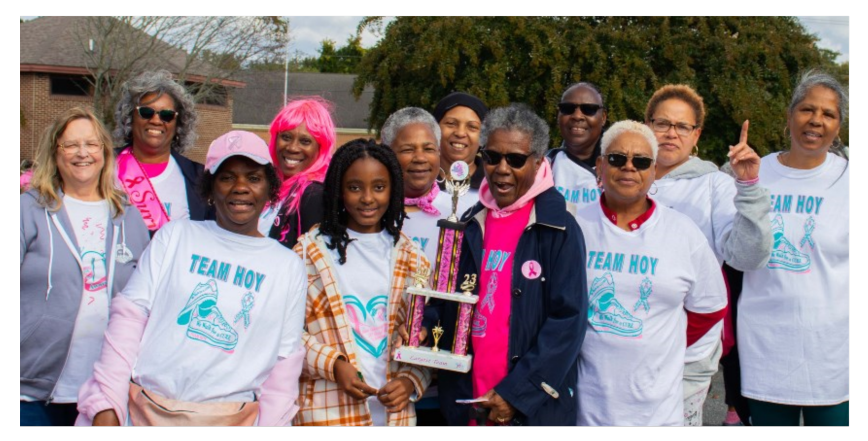
Largest Team & Best Designed T-Shirt Winner - Team Hoy