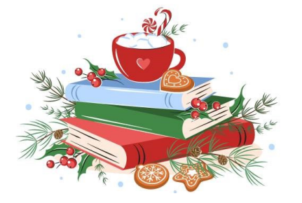
See what WSW staff members are reading and recommending!

Airport Self Storage Pepsi Bottling Ventures