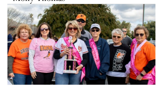
Top Team Fundraiser Winner - O's Fans for a Cure