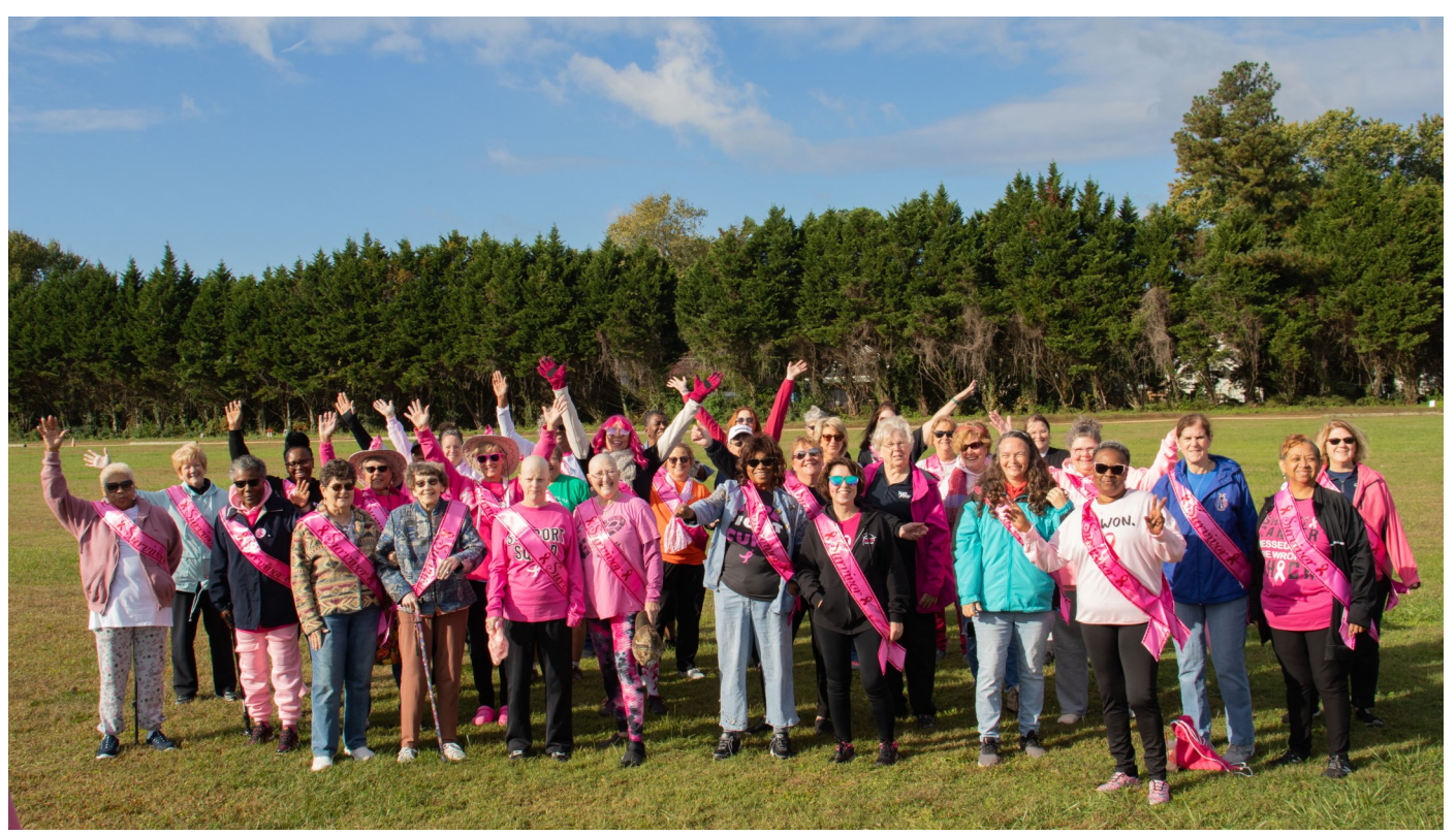
2023 Walk for Awareness Survivor Photo